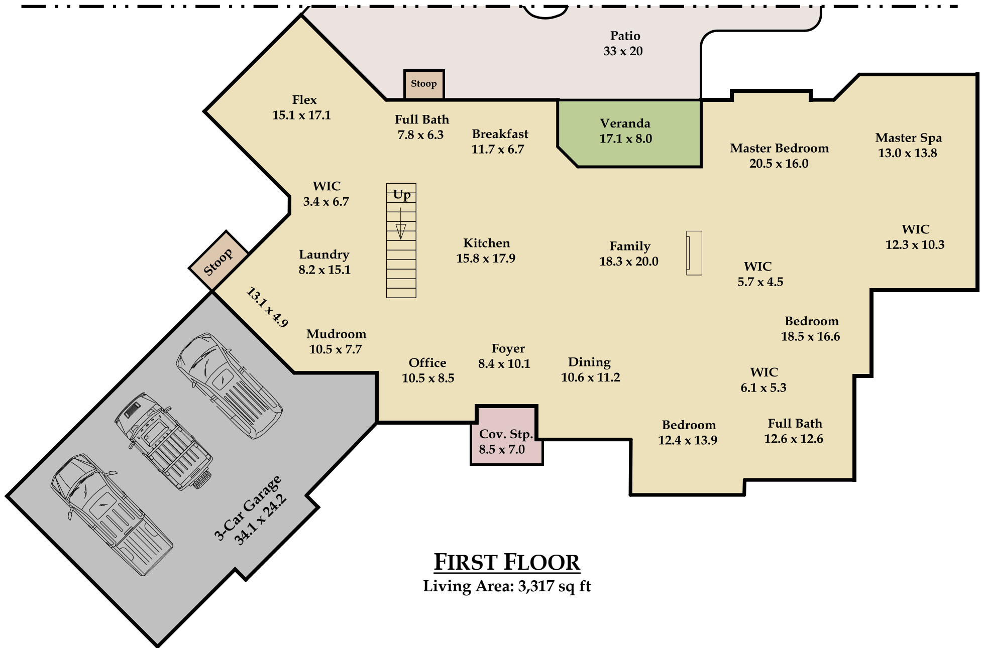
FIRST FLOOR Living Area: 3,317 sq ft